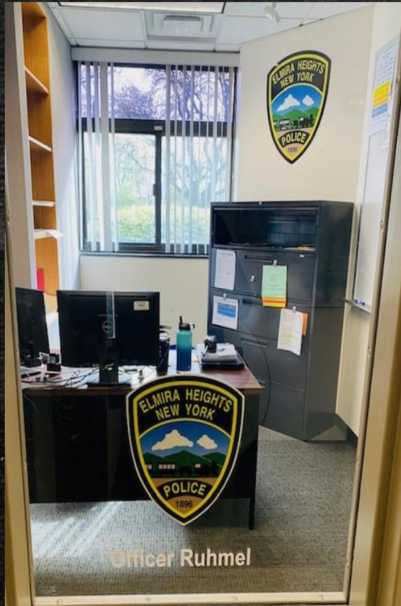
SRO OFFICE AT EDISON