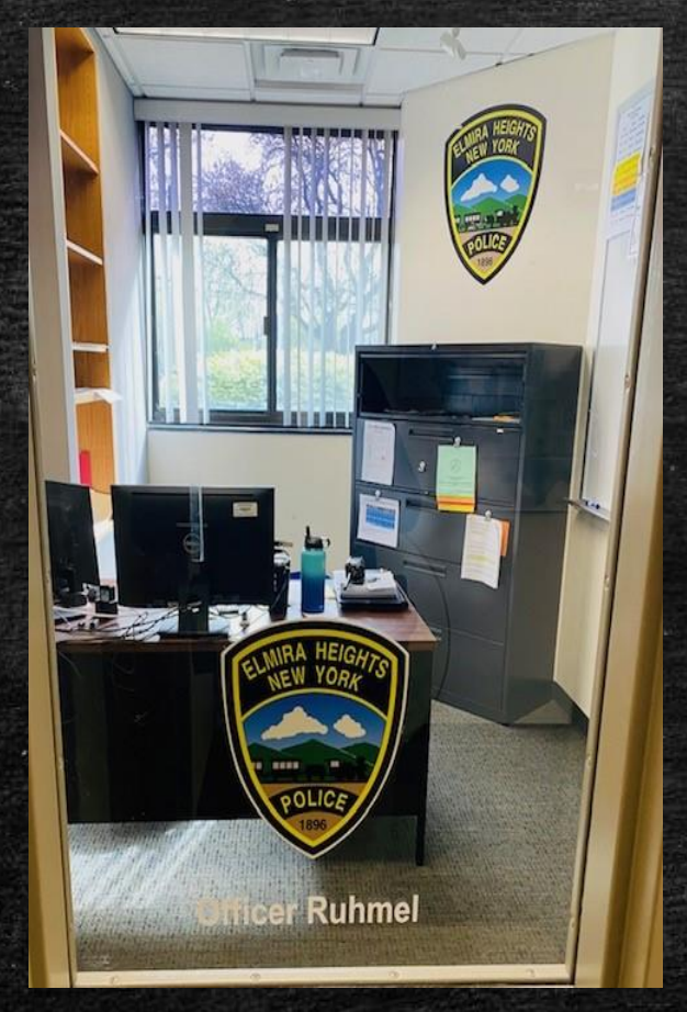
SRO OFFICE AT EDISON